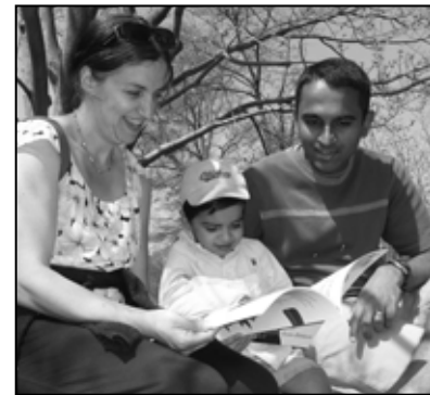
Every family with young children should know the joy of books and reading aloud.

Thanks to funds raised during the 10th Birthday–We Must Do More Campaign we are able to begin the process of deepening and strengthening our programs.