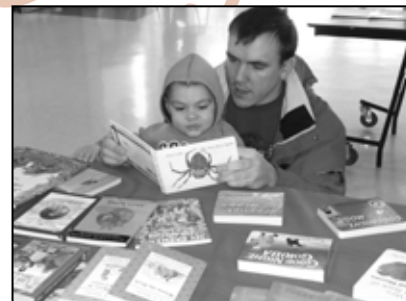
Father and son choose a new book to take home through Give the Gift of Family Reading program at their WIC appt.

Kids' Book Fest celebration of children's literature first held with close to 1,000 in attendance. Aliki generously gave permission to use her drawing of the girl hugging book as FRP icon. Program Coordinator added to staff.