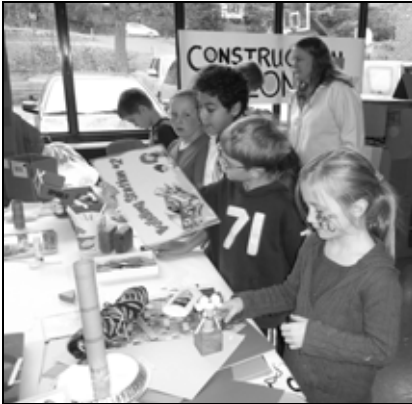
Children made their own houses out of cardboard and found objects.