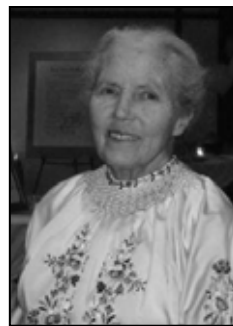
At Kids' Book Fest '08, Ruth Stiles Gannett Kahn will be the featured author.