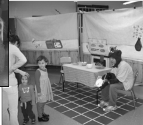
The featured book was made into an interactive area where the book's characters read stories.