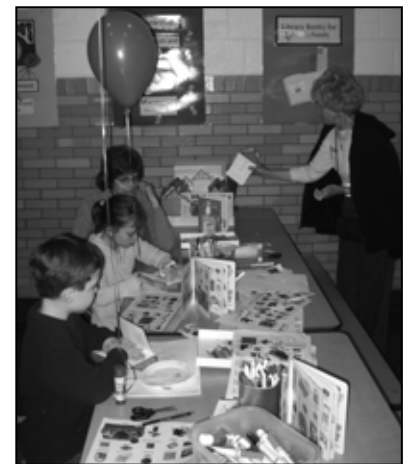
Family Reading Partnership of Chemung Valley hosted a very successful Kids’ Book Fest in March with the theme of “homes” based on FRP’s last Book Fest.

In only five years of website activity, we have had hundreds of requests from individuals and organizations from 27 New York State communities, 17 other states and three other countries for information about how to start their own Family Reading Partnership, how to start one of our programs or how to learn more about read-aloud and books.