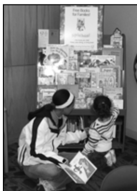
The newest Bright Red Bookshelf was placed in the Emergency Dept. at Cayuga Medical Center and used immediately by a family waiting for a loved one.

1999 First Book for First Graders program began. This program gave new books to first graders for four years.