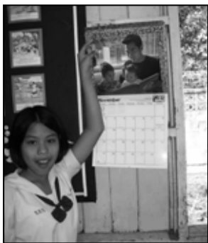
Our 2008 “Read to Me” calendar featuring families from Ithaca, NY, made its way to a school in Thailand where a friend of FRP was working.

The public library in Batavia, NY, purchased 12 “Read to Me” banners with their “GRO” logo added. The banners will hang on buildings there to inspire families to read to their children.