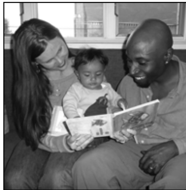
We have given more than 200,000 books to families in our area since Family Reading Partnership began.

“The Read-a-thon helped me broaden my reading zone,” says a young reader who was part of this elementary school event for students.