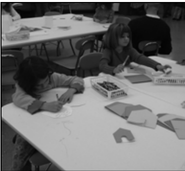
Bookmaking was done with house and barn shaped books.

At Home with Books figures and 3-D house were given to children to take home and color.